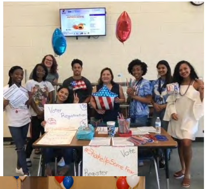
Below, LWVCM members at the annual meeting. More photos of the 2018 annual meeting will be available at https://winningimages.photography/about July 14 .