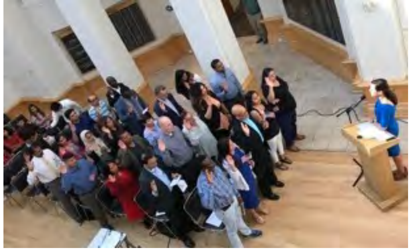
Naturalization Ceremony at the Levine Museum of the New South.