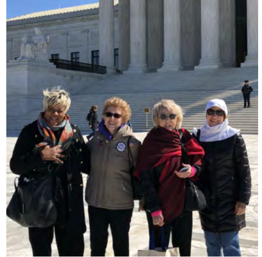
League members at the US Supreme Court to hear arguments in the League's NC gerrymandering lawsuit.